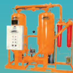
Desiccant Dryers Heatless & Heated