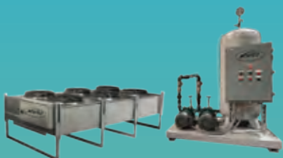
Water Saver and Pumping Stations