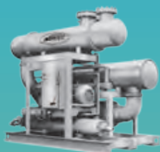
High Capacity Dryers