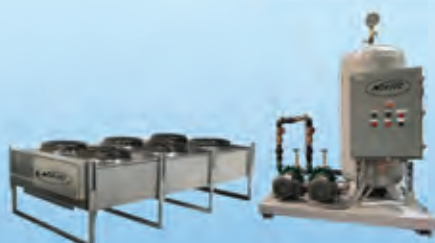
Water Saver and Pumping Stations