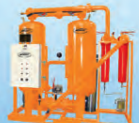
Desiccant Dryers Heatless & Heated