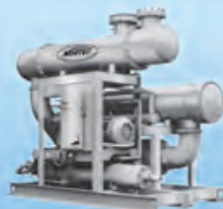
High Capacity Dryers